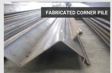
FABRICATED CORNER PILE