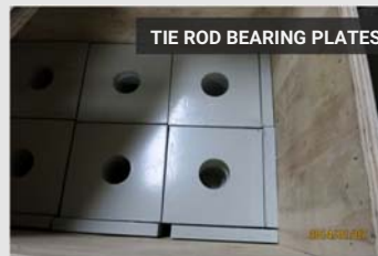
TIE ROD BEARING PLATES