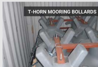
T-HORN MOORING BOLLARDS

In addition, an International Sister Seaport agreement was signed between Port Lafito and Port Miami in order to collaborate on the exchange of information and ideas, with the aim to increase cargo and trade between ports. Port Lafito partnered with SSA Marine, the world's largest independent and privately-held marine terminal operator, to oversee the port and terminal operations. The efficiencies and modern capabilities provided at the newly built Port Lafito will enable Lafito to improve and broaden the level of service to the Haitian customers. And increase business opportunities in Haiti.