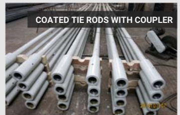
COATED TIE RODS WITH COUPLER