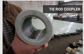
TIE ROD COUPLER