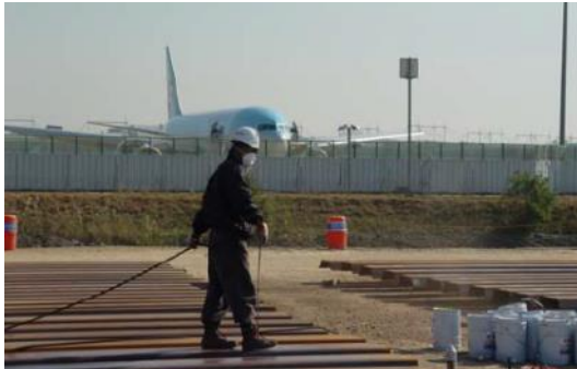
① Sheet piles have to be arranged level.

Achieving water tightness of a sheet pile wall can be challenging, given the site conditions, difficulty in sealant applications, high interlock temperatures during driving and other factors. ESC has addressed these issues through its design and extensive experience and is willing to deliver both standard and tailored solutions to project requirements. Here is a full guide on the application and best practices for obtaining a water-tight interlock: