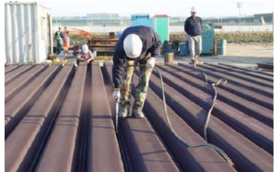
② Remove the dust or rust in the interlocks using an air compressor.