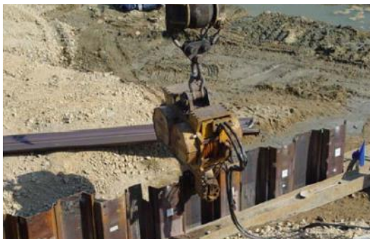
⑤ Drive the sheet piles after the drying the DPS-500 (after one day).