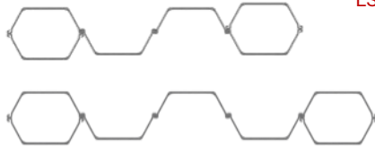
ESC-9J Welded Interlock