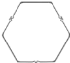
Triple U Box Pile