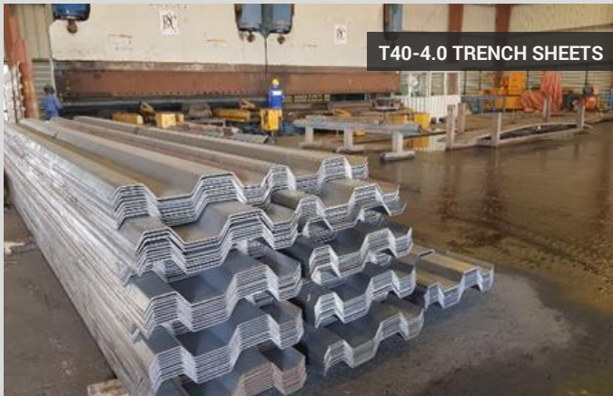
T40-4.0 TRENCH SHEETS