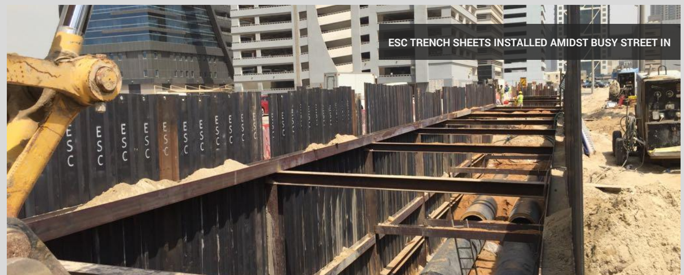
ESC TRENCH SHEETS INSTALLED AMIDST BUSY STREET IN