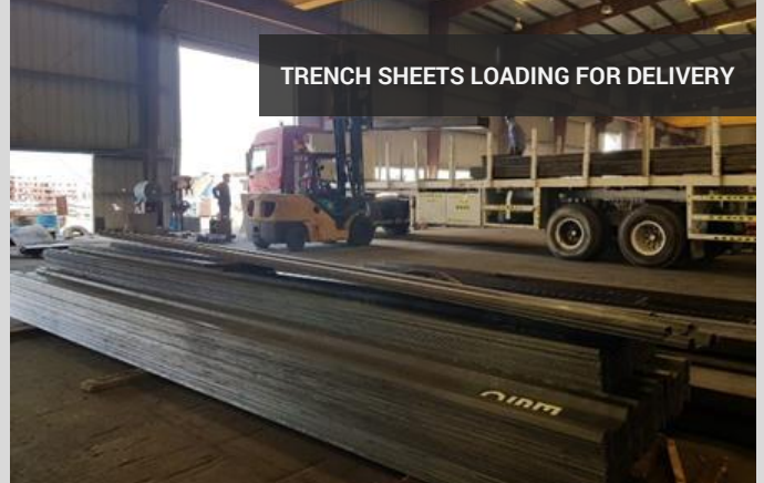
TRENCH SHEETS LOADING FOR DELIVERY