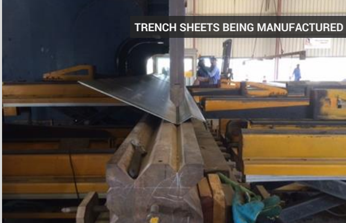
TRENCH SHEETS BEING MANUFACTURED